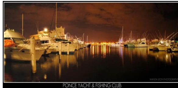
PONCE YACHT & FISHING CLUB